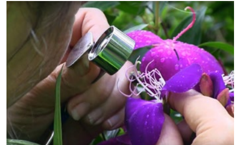
Crop monitoring requires a systematic approach and a thorough understanding of pest biology.

This Nursery Paper looks at the need for nurseries to transition from using pesticides to applying Integrated Pest Management (IPM) principles to future-proof production.