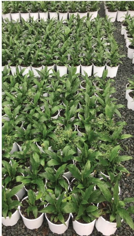
Regular monitoring can prevent a small problem becoming a larger issue.

This includes augmenting natural enemies, combining alternative methods to be more effective, selecting products that are more compatible with