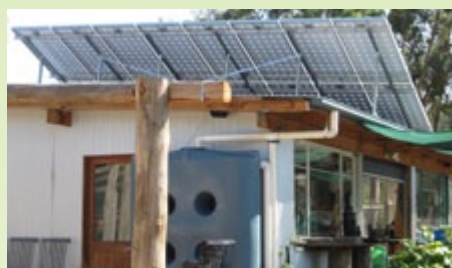
A 4 Kilowatt Solar System at the Wandella production site (one of two Solar Systems).

In moving forward, Lisa and David have indicated that by improving their MYOB record keeping system, they aim to better capture the specific data required in the NurseryFootprint tool in order to have more accurate results. This will also enable them to make more changes in order to increase their efficiency whilst continuing to reduce their carbon footprint.