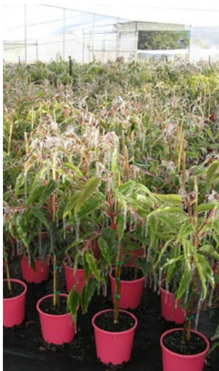
Eucalyptus crop protected by irrigation (Palmwood Tropicals)

is generally accepted as an effective management for frost incidences down to approximately -7°C. The ice formation can also act as a film of insulation on the foliage and protect plant parts from air temperatures below freezing.