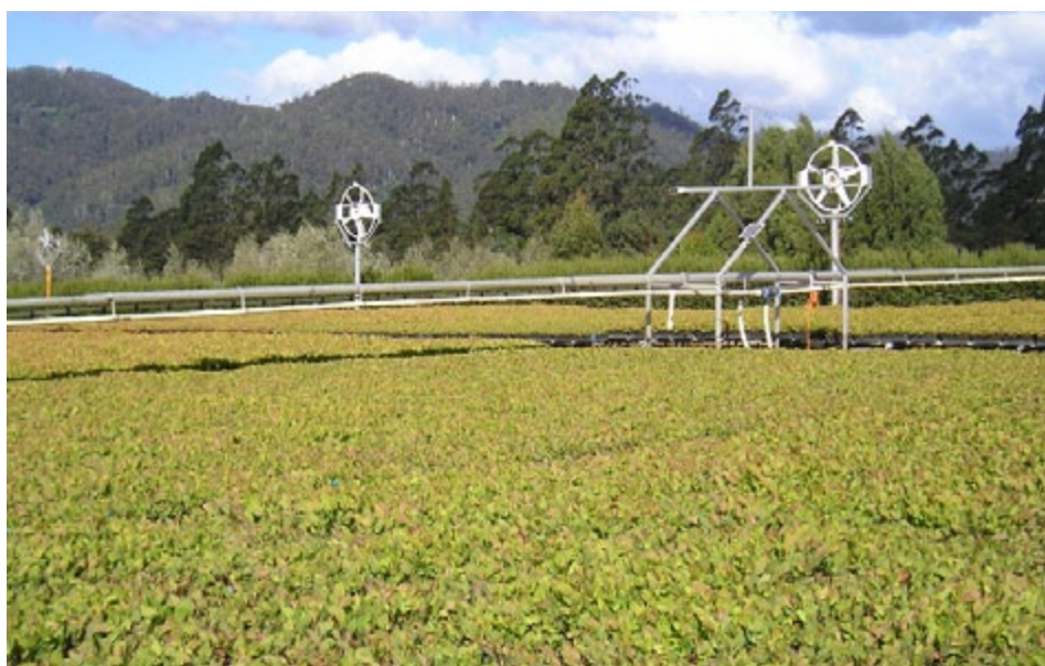
Frost mitigation fans (Woodlea Nursery)

A final point of interest; information from researchers in Tasmania suggests there is evidence to show plant species are susceptible to phyto-burning (sunscald). This is the result of intense sunlight burning the plant foliage due to the clear atmosphere that is present after a frosting event. This can be alleviated through various covers placed over crops believed to be susceptible.