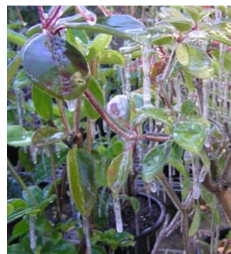
Vireya crop protected by ice (Palmwood Tropicals)

growing areas. Initial evaporative cooling can drop leaf temperature by 1 – 2°C therefore irrigation should commence prior to the temperature reaching 0°C e.g. 3°C which can also help avoid irrigation pipes and solenoids from freezing closed.