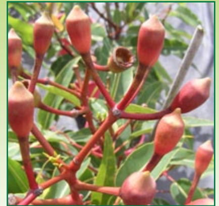
Eucalyptus buds after a frost event