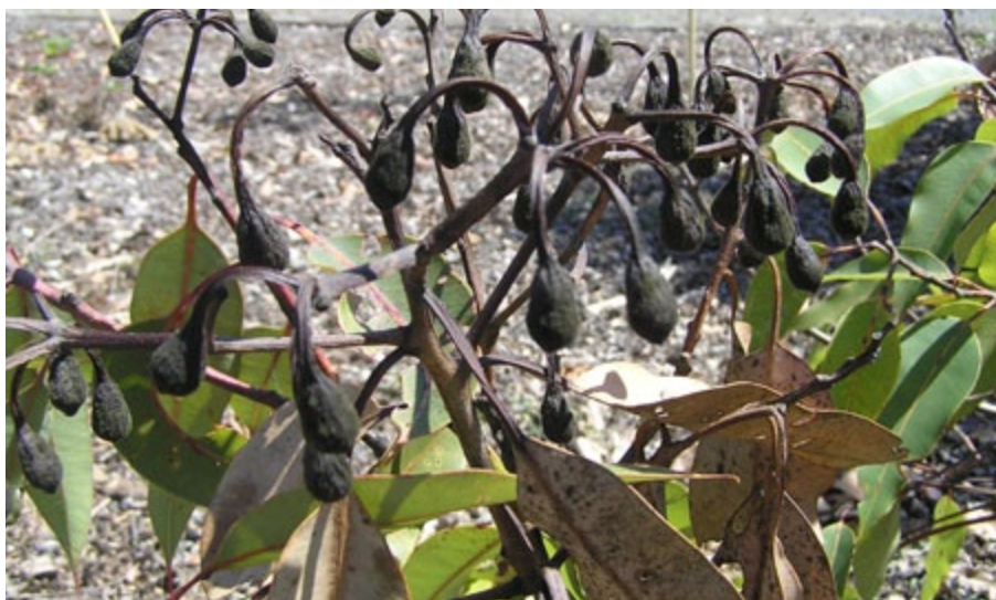
Eucalyptus buds damaged (Palmwood Tropicals)

Many producers protecting crops from frost will add a “safety factor” to their minimum temperature threshold (e.g. frost protection measures triggered at 3°C at standard 1.5m thermometer reading). Be aware that cold air is dense air and will flow, due to gravity, to the lowest areas in the nursery and collect in what are termed frost pockets or cold spots. Cold air can also be dammed against fences, vegetative areas such as hedges and dense shrub plantings as well as permanent structures such as buildings. Use a number of thermometers around the nursery to record the temperature differences that occur over the entire site which will allow you to identify potential problem areas.