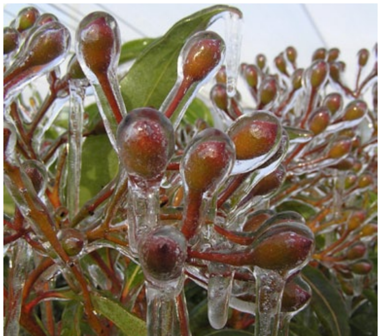
Eucalyptus buds protected by ice

Frosts are caused when air temperatures at ground level drops below 0°C, with low air movement and a clear night sky resulting in heat transfer from plants to the atmosphere. The decrease in temperature causes water in plant cells and within intercellular spaces to freeze into ice. This, in due course, ruptures cell walls and plant tissue. The management of frost and the limitation of damage to nursery crops need to be understood to be effective in both protected and unprotected cropping systems in frost sensitive areas.