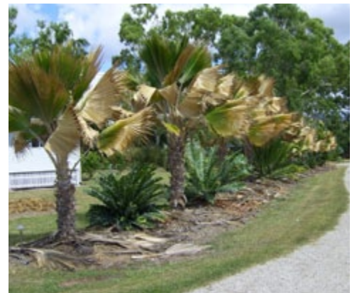
Frost damage (Denby Cycads Townsville)

The most obvious mitigation measure is site selection and ensuring the crops are grown in areas that are less likely to offer cold air traps. Ensure that the site has good air drainage and in frost prone areas this typically means growing the most frost sensitive plants upslope and the hardier stock closer to the flat ground. Avoid artificial air traps such as structures, earth works and vegetation including hedges and windbreaks that are placed down slope or in the prevailing wind direction. Research has also shown crops grown close to large bodies of water (farm dam) are less likely to be frost damaged due to the heat transfer keeping the surrounding air temperature higher.