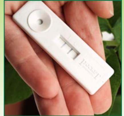
The portable Pocket Diagnostic™ Test Kit.