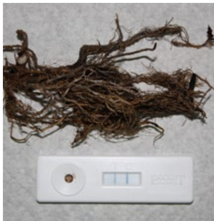
Positive detection for Phytophthora spp extracted from root sample.

Currently Forsite Diagnostics have a range of Pocket Diagnostic™ Test Kits servicing a number of horticultural industries, covering a range of pathogens, including potato, tomato, perennial fruit, vegetable, cut flower and nursery production. A recent advancement in the marketing strategy by Forsite Diagnostics is a Pocket Diagnostic™ Test Kit directed at the home gardener (e.g. Phytophthora & Botrytis) being sold throughout 130 garden centres in the UK.