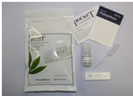
The Pocket Diagnostic™ Test Kit (phytophthora spp)

(approximately 10 - 20% of the cost for current laboratory based testing).