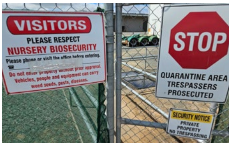
Appropriate signage should alert visitors BEFORE they enter the nursery.

At each step of the propagation and production cycle, ask yourself what the intended outcome of the process is. Consider whether there are steps you can improve or eliminate steps to reduce the risk of pathogen introduction and plant exposure.