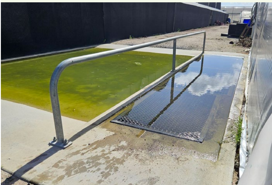
Dual foot bath and vehicle bath with safety rail.

Conducting regular risk assessments enables nurseries to identify emerging threats, assess vulnerabilities, and refine biosecurity strategies. Flexibility and adaptability in response to evolving biosecurity challenges, such as the emergence of new pathogens or changes in pest distribution patterns, are essential for maintaining the efficacy of foot bath protocols. Incorporating feedback mechanisms, incident reporting procedures and post-implementation reviews facilitates continuous improvement and adaptive management practices within the nursery environment.