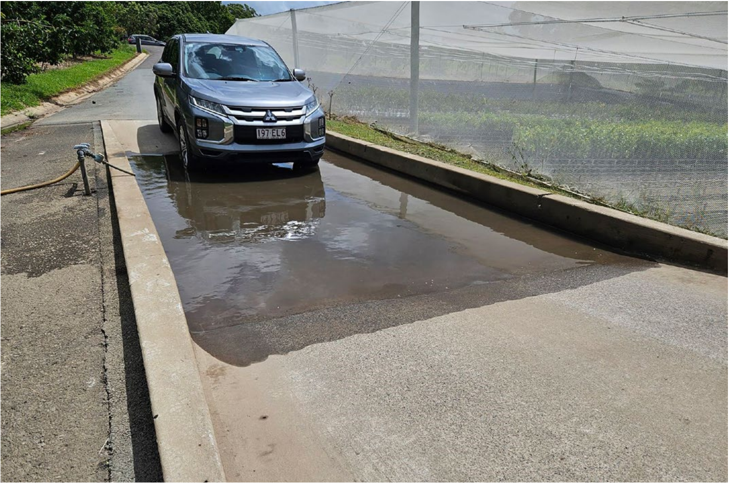
Vehicle baths must be of a sufficient size that wheels completely come in contact with disinfectant.

The primary function of vehicle baths is to disinfect external surfaces of vehicles and equipment, effectively removing adherent soil, organic matter and potential biosecurity threats. Using high-pressure sprayers or immersion systems, vehicle baths deliver disinfectant solutions to neutralise a broad spectrum of pathogens, including bacteria, fungi, viruses and nematodes.