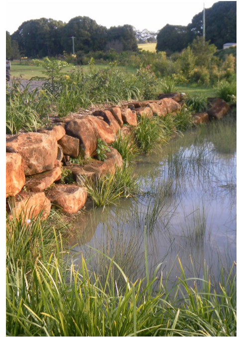
Vegetated drainage channels

While many nurseries use bottom up and trough irrigation as well as overhead booms to deliver precision irrigation water application, we encourage monitoring the Bureau of Meteorology (BoM) weather data and onsite weather stations to guide irrigation practices as well as using media moisture sensor probes and load cells for weight-based irrigation.