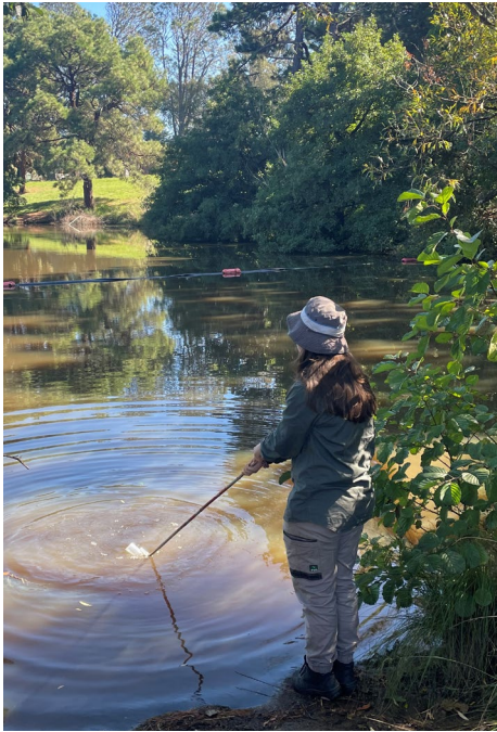
Taking water samples from a dam