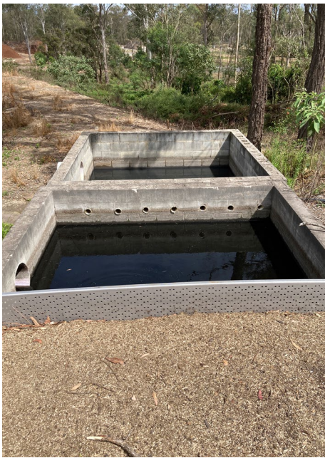
Debris and silt traps

If you can't seal your major roads, reduce dust from trucks and tractors by using windbreaks to slow and disrupt the wind flow. Install debris and silt traps to minimise floating trash entering waterways.