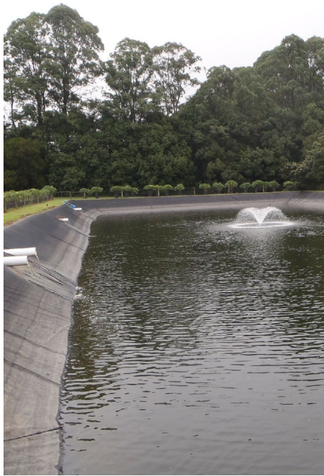
Lined recycling dam with aerators