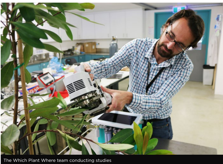
The Which Plant Where team conducting studies

In urban areas small trees are spaced at 5m to 7m intervals, medium trees at 7m to 10m and large trees at 10m to 15m. In the long-term, this foresight will minimise maintenance costs (e.g. pruning, removal and replacement) and infrastructure damage (e.g. lifting and cracking of footpaths and roads).